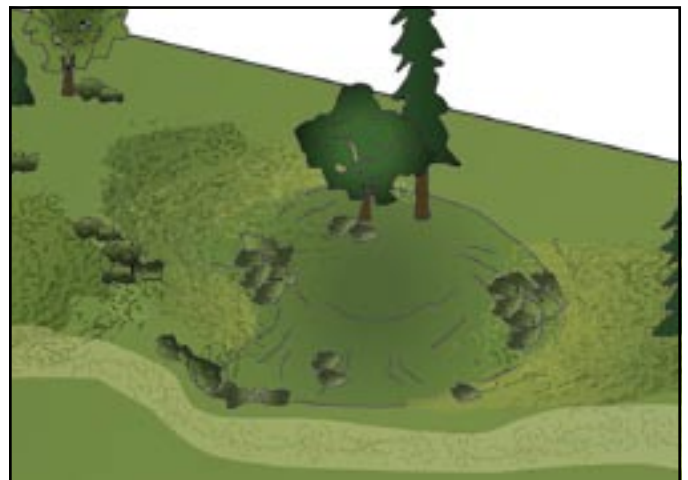
Add paths and highlights with Accent Turfs.