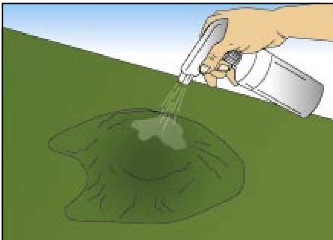
Spray adhesive on area to be landscaped.