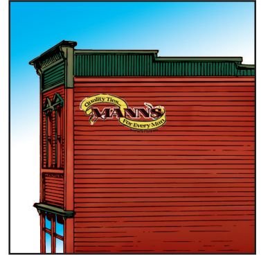
4. Finished Decal conforms to texture.

Conforms to Health Requirements of ASTM D4236