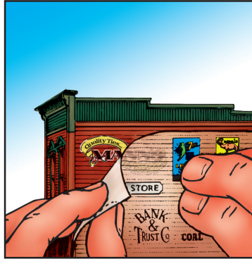
2. Lift away carrier sheet carefully.